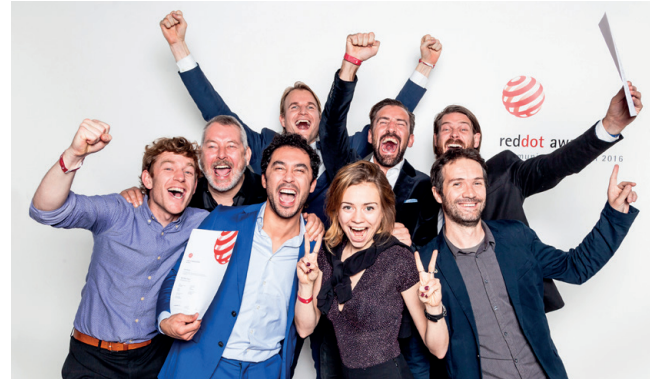
Stolze Preisträger | Proud winners

Der Red Dot Award: Communication Design bietet Agenturen, Designern und Unternehmen aus aller Welt eine Plattform für die Evaluierung ihrer Gestaltungs- und Kreativleistungen. Eine unabhängige Jury bewertet jeden einzelnen Beitrag individuell und vergibt das Red Dot-Siegel ausschließlich an Arbeiten, die mit guter Designqualität und Kreativität überzeugen. Der Red Dot Award: Communication Design feiert 2017 sein 25-jähriges Jubiläum und ermittelt heute Bestleistungen aus mehr als 45 Nationen.