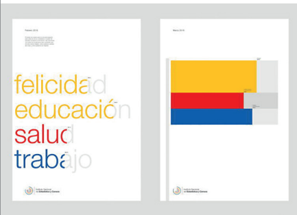
The Real Time Brand Relaunch Category: Corporate Design & Identity Design: Grey Germany / KW43 Branddesign, Düsseldorf & Maruri Grey, Guayaquil Client: INEC, Quito Red Dot: Grand Prix