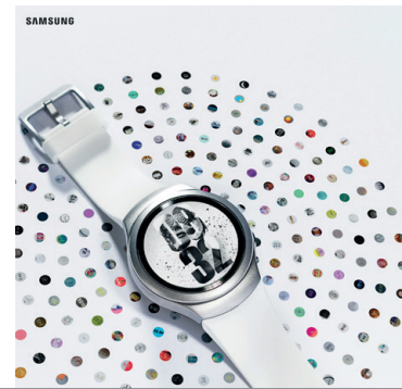
Design Your Time Social Media Campaign Category: Advertising Design: Leo Burnett Germany, Frankfurt/Main Client: Samsung Electronics, Schwalbach Red Dot: Best of the Best