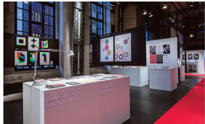
Siegerausstellung „Design on Stage“ im E-Werk Berlin Winners' exhibition "Design on Stage" at the E-Werk Berlin

All prize-winning designs were presented in the large exhibition “Design on Stage” in Berlin in the autumn of last year. Now, the Red Dot Design Museum Essen is showcasing a selection of the latest trends, strategies and projects of the creative industry. Besides international achievements, awarded works from the federal state of North Rhine-Westphalia are also on show.