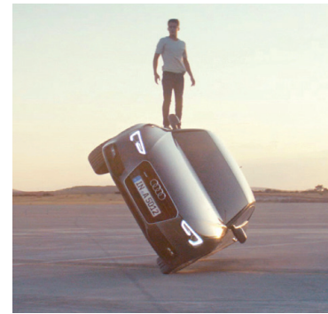
Relaxed TV Commercial Category: Film & Animation Design: thjnk berlin, Berlin Client: Audi, Ingolstadt Red Dot: Best of the Best Red Dot: Brand of the Year 2016